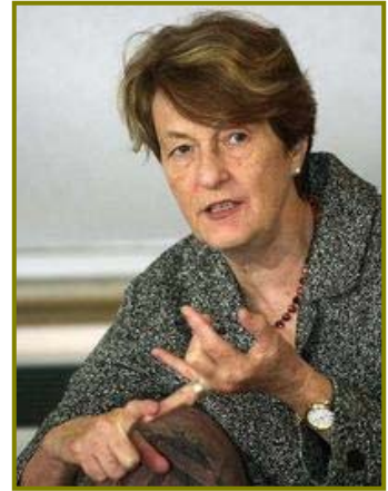
Australian anti-nuclear activist, Dr. Helen Caldicott.