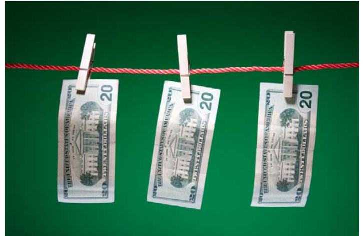
We shrink the margins to save paper!

If you have a question about exemption and your activities, you can learn more about the legal and governance issues at http://www.afj.org/for-nonprofits-foundations or call PLL national.